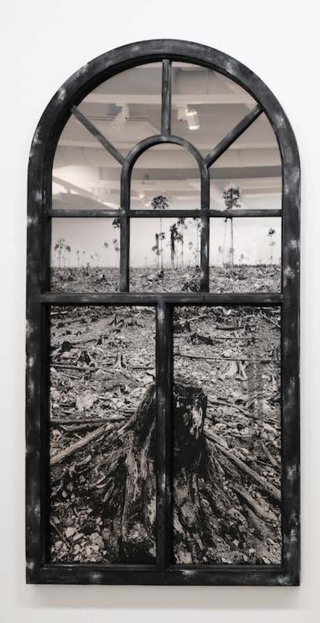
Reflexive Landscapes, 2021 UV print on Neobond, wood frame and forest ashes 230 x 95 cm HAM - Helsinki Art Museum